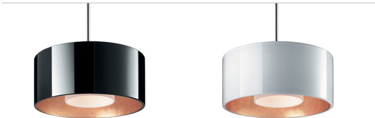
501 black outer/gold inner