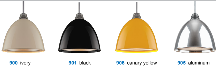
*top row shown with LLED