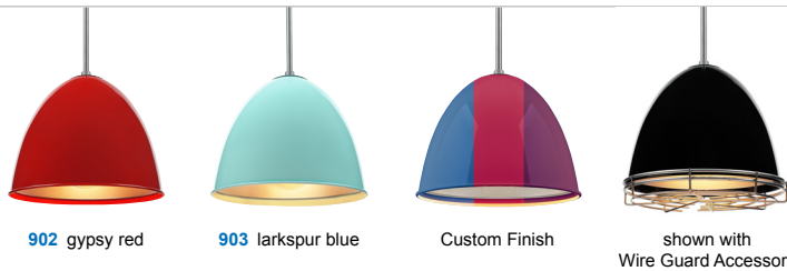
*bottom row shown with LE26