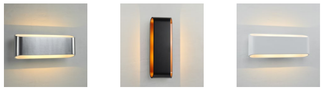
AL/WH BK/G WH/WH