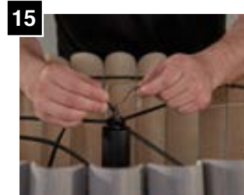
15 Loop same end of aircraft cable through balancer.