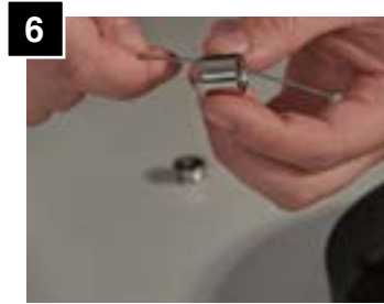
6 Completely feed aircraft cable through coupler, until stop is reached.