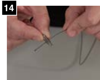
14 Pass aircraft cable through one hole of strain relief.