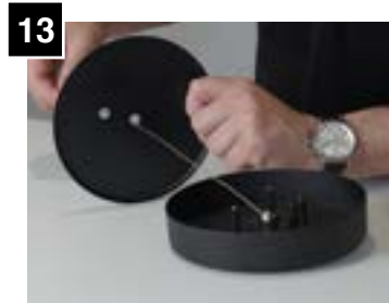
13 Same as Step 12.