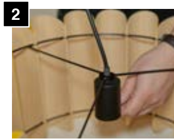
2 Pull cord until socket bottoms out.