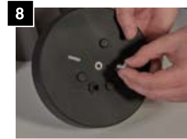
8 With screw supplied fasten coupler end cap from back of canopy.