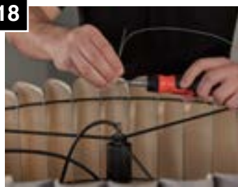
18 Same as step 17.