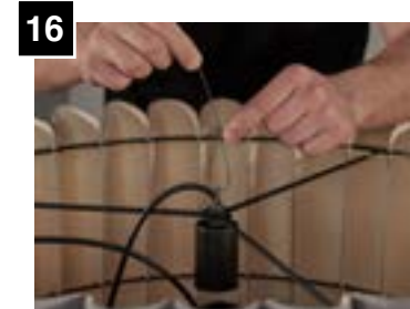
16 Continue to feed aircraft through remaining opening of strain relief.