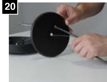
20 Same as step 19.