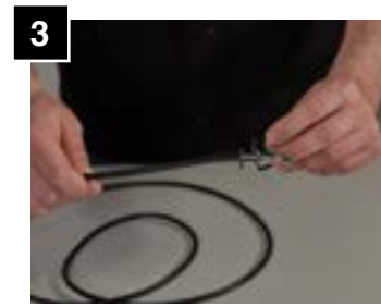
3 Feed lock washer and nut/balancer through cord.