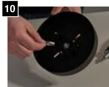
10 Twist and tighten coupler with aircraft cable to coupler end cap.