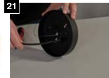
21 Pass power cord through strain relief (black) and twist to tighten power cord. Adjust length of power cord prior to tightening.