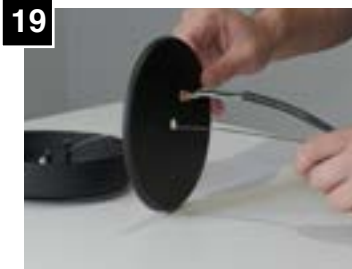
19 Feed powercord through off center hole of canopy cover.