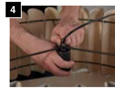
4 Firmly tighten socket to shade ring.