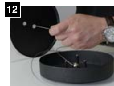
12 Feed aircraft cable through backside center hole of canopy cover.