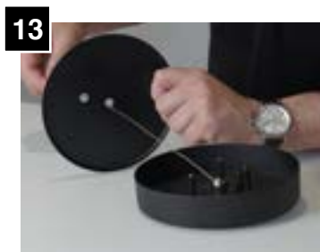
13 Same as Step 12.