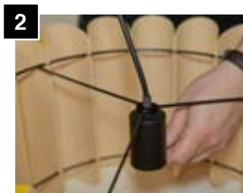
2 Pull cord until socket bottoms out.