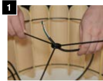
1 Feed cord through ring.