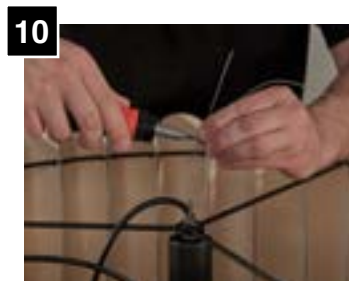
10 Tighten both screw of strain relief and adjust aircraft cable length as needed. Cut loose aircraft cable if necessary.