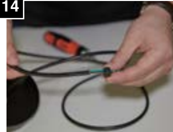
14 Feed additional strain relief through cord.