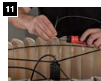
11 Same as Step 17.