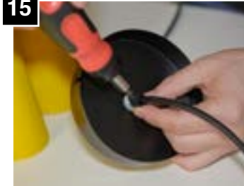
15 Slide down until it bottoms out and tighten set screw.