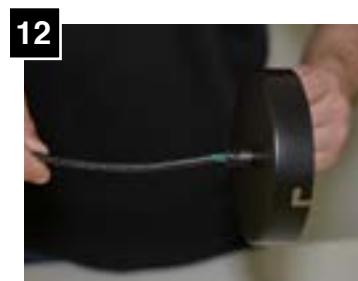
12 Feed cord through canopy.