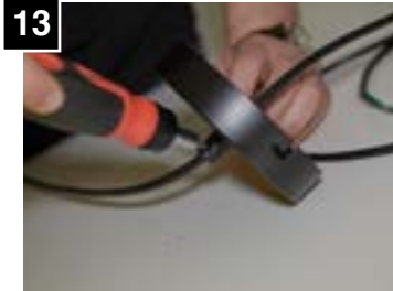
13 After adjusting cord length, tighten set screw on canopy.