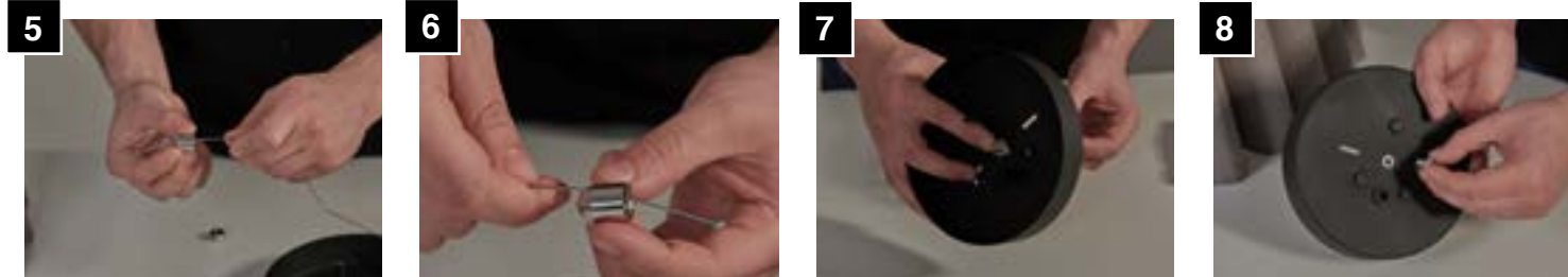
5 Twist off end cap from cable coupler and feed aircraft cable.