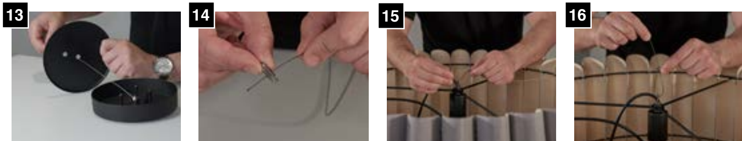
13 Same as Step 12.