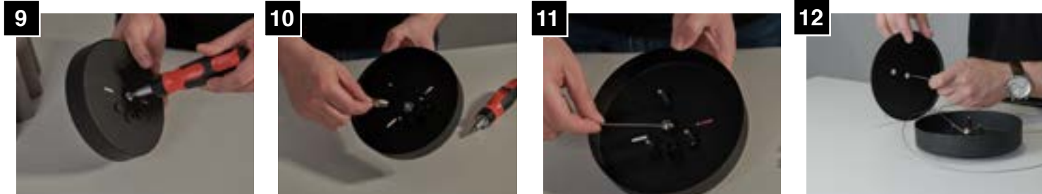
9 Same as Step 8.