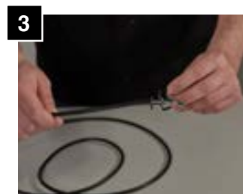
3 Feed lock washer and nut/balancer through cord.