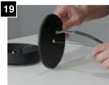
19 Feed powercord through off center hole of canopy cover.