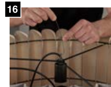
16 Continue to feed aircraft through remaining opening of strain relief.