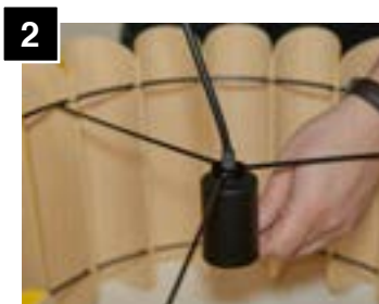
2 Pull cord until socket bottoms out.