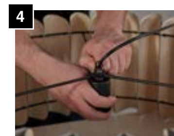
4 Firmly tighten socket to shade ring.