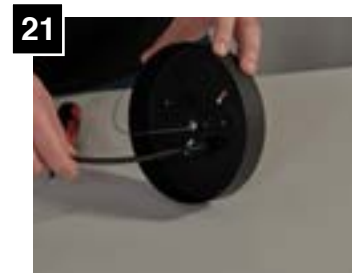
21 Pass power cord through strain relief (black) and twist to tighten power cord. Adjust length of power cord prior to tightening.