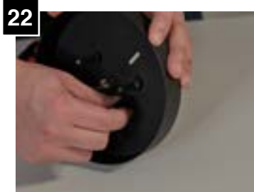
22 Same as step 21.