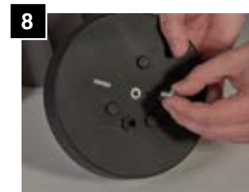
8 With screw supplied fasten coupler end cap from back of canopy.