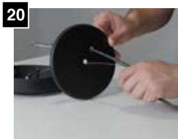
20 Same as step 19.