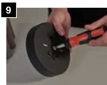
9 Same as Step 8.