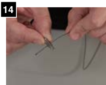
14 Pass aircraft cable through one hole of strain relief.