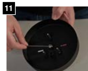
11 Same as Step 10.