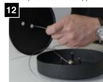
12 Feed aircraft cable through backside center hole of canopy cover.