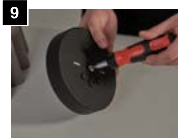
Same as Step 8.