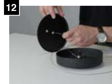
Feed aircraft cable through backside center hole of canopy cover.