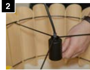
Pull cord until socket bottoms out.