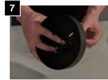
Hold coupler end cap inside canopy.