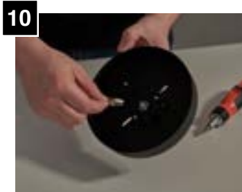
Twist and tighten coupler with aircraft cable to coupler end cap.