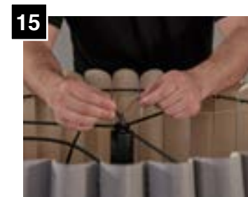
Loop same end of aircraft cable through balancer.