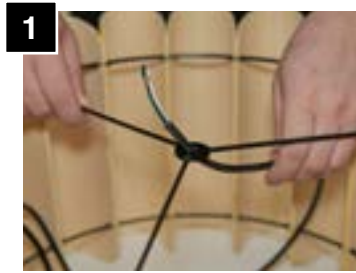
Feed cord through ring.