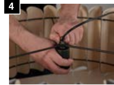
Firmly tighten socket to shade ring.