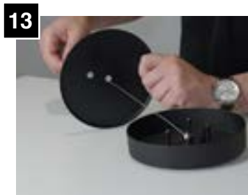
Same as Step 12.