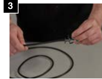
Feed lock washer and nut/balancer through cord.