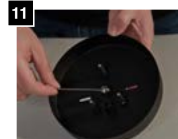
Same as Step 10.