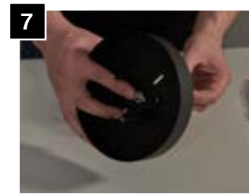
Completely feed aircraft cable through coupler, until stop is reached.